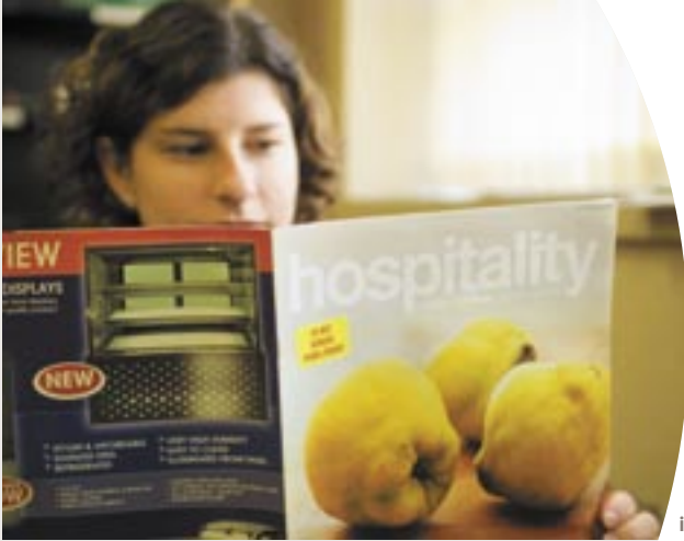
The Nestlé Library in the School of Hotel Administration is a center for hospitality research and student access to timely industry information.